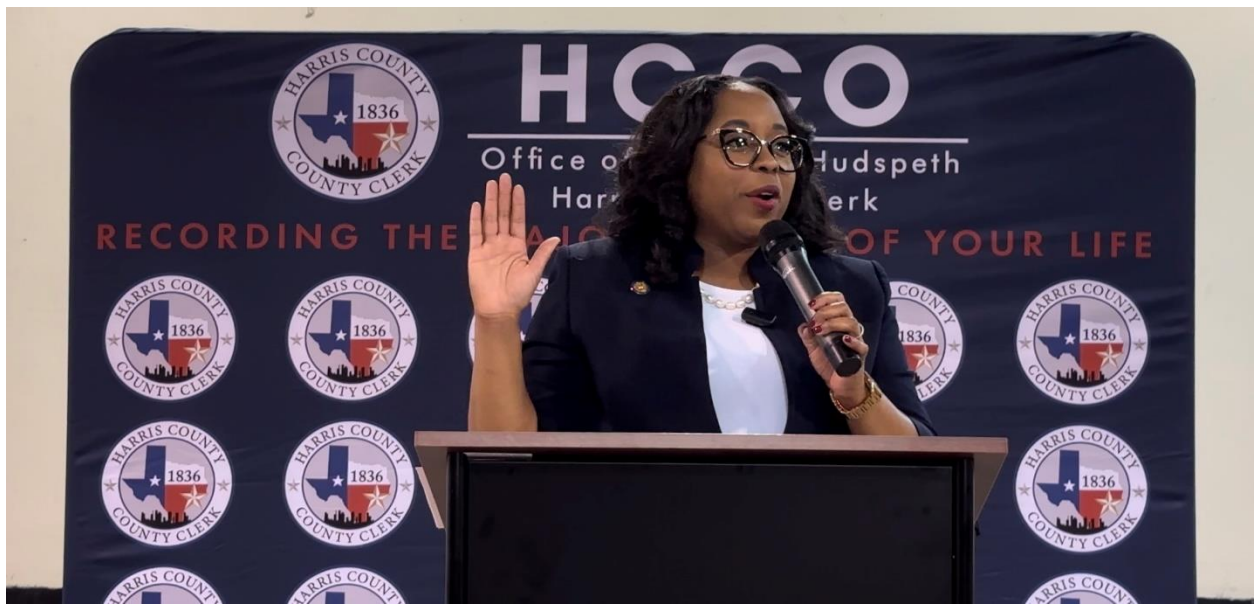
Harris County Clerk Teneshia Hudspeth deputizes more than 100 election staff members at NRG Arena where Central Count for the November 7 Election is located.