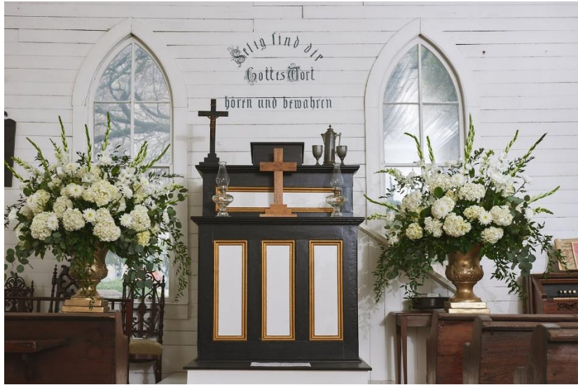
1891 St. John Church